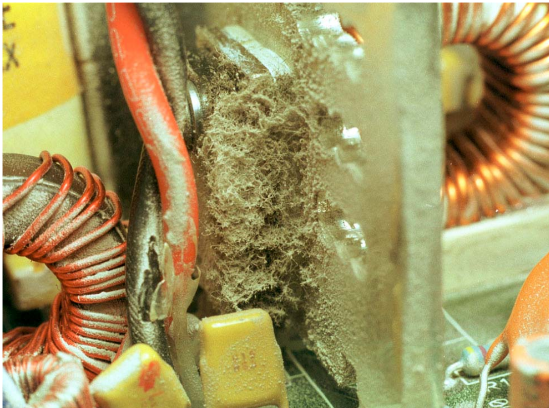
Dust and debris at component location BR100

Upon disassembly of the power supply we did notice the presence of large amounts of debris on certain components. This consisted of dust and fibers that had adhered to the surfaces of semi-conductors and power resistors. Viewing of the debris under moderate magnification showed that several types of fibers were present in the debris. These included (and are not limited to) hair, plastic filaments, textile fibers, black filaments resembling carbon fibers and very small shiny strands. A complete analysis of the fiber masses was not conducted at the time of our investigation. The fibers bridged the gap between semiconductor ground plates and heat sinks used for cooling, as well as bridging one lead of AC high voltage resistor, R76, to the heat sink. Inspection of the metal chassis housing the power supply revealed a small protrusion of dust and debris on the metal plate that contacted the edge of the circuit board near component location fuse F2. (See pictures below).