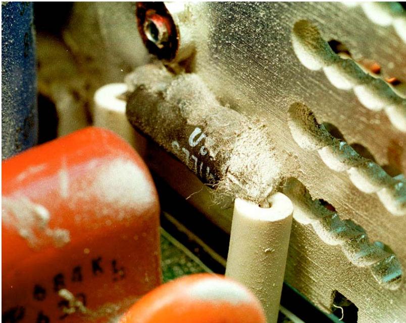
Dust and debris at component location R76